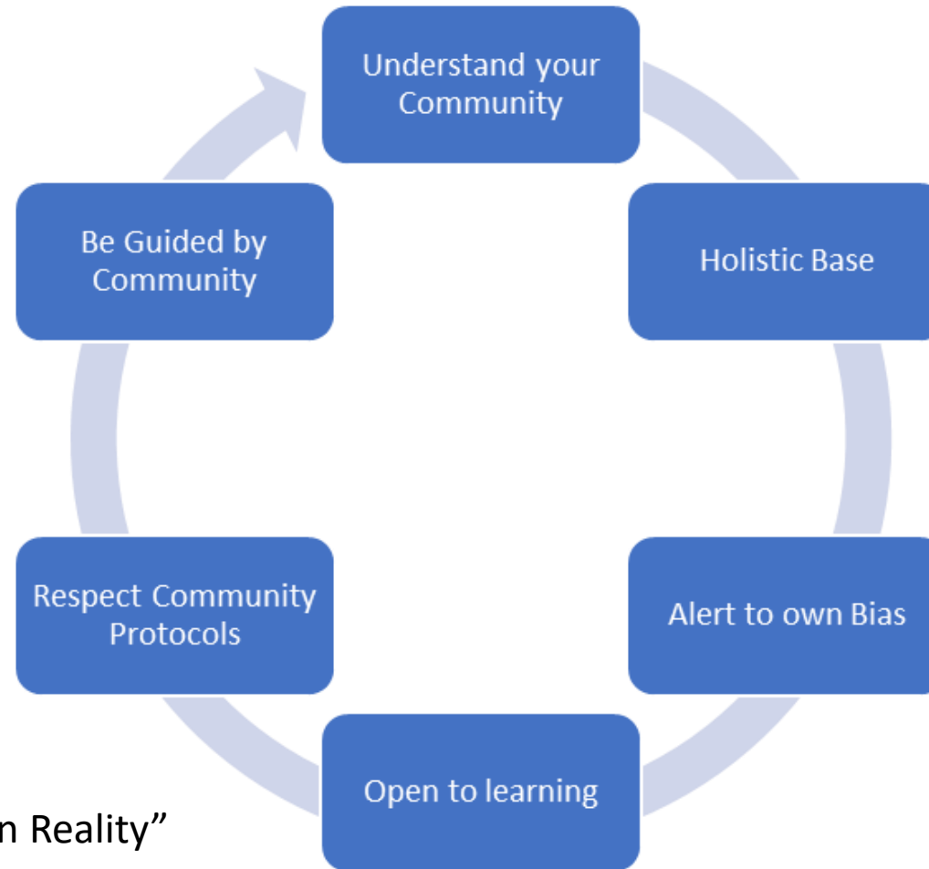
Figure 1. “Meeting People in their Own Reality”

Reference: Dennis McDermott (2019) “Big Sister” Wisdom: How might non-Indigenous speech-language pathologists genuinely, and effectively, engage with Indigenous Australia?, International Journal of Speech-Language Pathology , 21:3, 252-262, DOI: 10.1080/17549507.2019.1617896